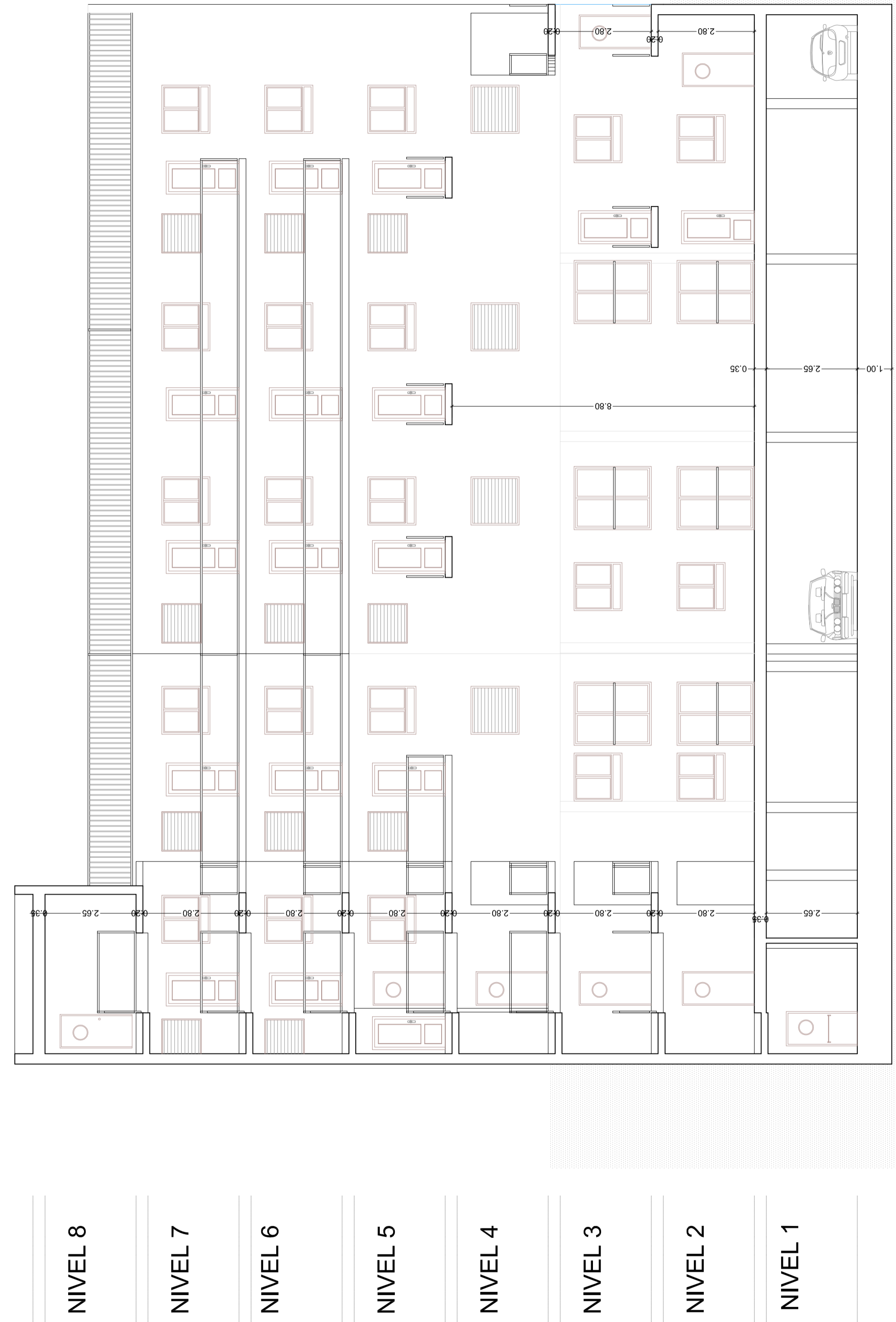
ALZADO SECCION D-D'